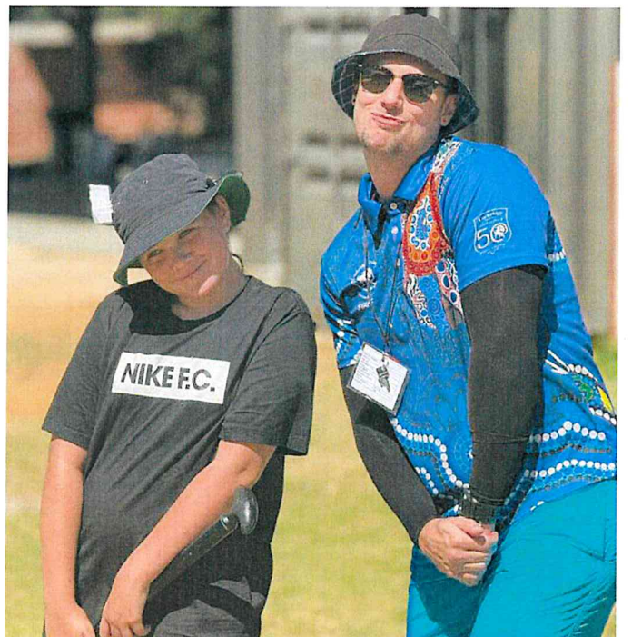
Fun at the Year 6 Camp