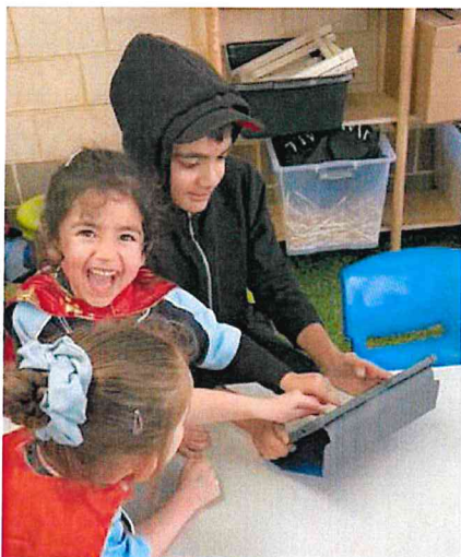
M3 & M6 Buddies