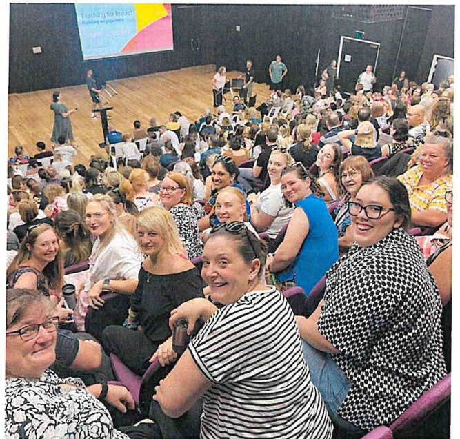
Some of our amazing staff engaging in learning at Kiara College