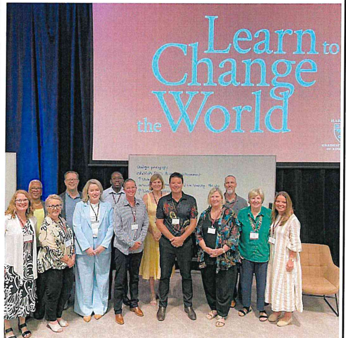
The small but strong WA contingent with professors and educators from Harvard University in the USA.

It was interesting to note that whilst we are engaged in many programs at the forefront of education in WA (Centre for Excellence, Culturally Responsive Leadership etc...) we also do things at Lockridge from which other schools can learn. —>